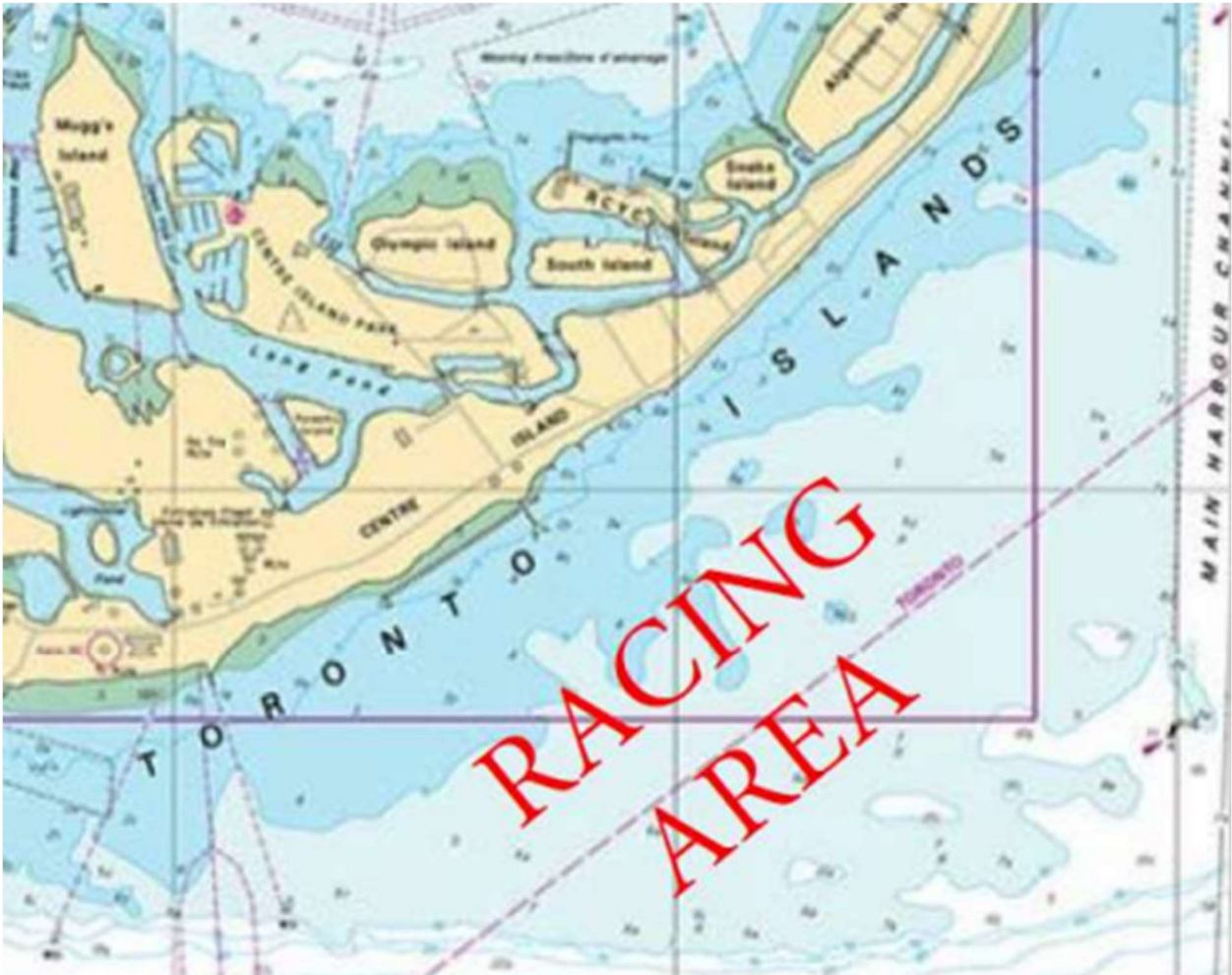
Figure 1: Racing Area

7.1. Racing area will be on Lake Ontario, South of the Toronto Islands.